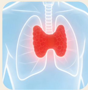
Micro-encapsulation for better absorption