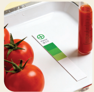
Ideal for long-term daily support

Not just a short-term fix — but long-term protection.