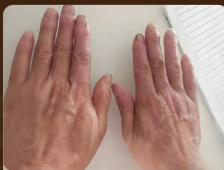
1 Month After Use